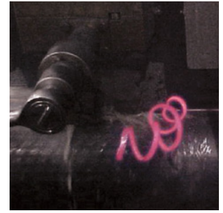
Figure 4: The extruded metal being cut from the outside of the welded tube