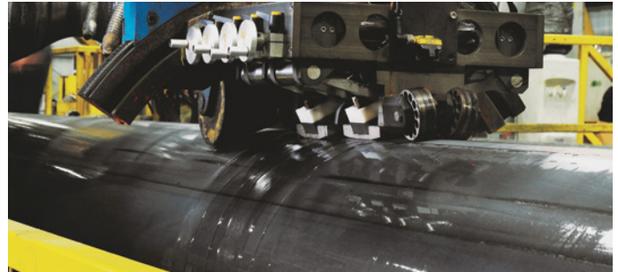
Figure 5: The tube being inspected for weld integrity with an ultra-sonic tester