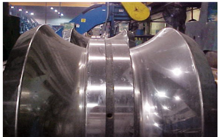
Figure 1: A typical fin pass roll