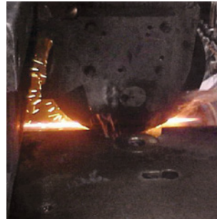
Figure 3: The tube leaving the high-frequency induction coil and passing through the weld pressure rolls

After the molten metal is extruded out of the weld area, it is cut from the outside and, if required, the inside of the tube to leave a smooth, flush surface (Figure 4). A “first off” of the weld is inspected at each setup with an in-line ultra-sonic tester (Figure 5). The amount of extrusion and the presentation and complete bonding of the strip edges are inspected to ensure weld integrity.