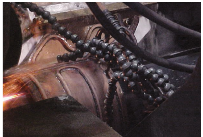
Figure 2: The tube passing through the high-frequency induction coil