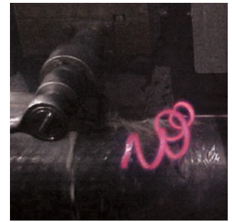
Figure 4: The extruded metal being cut from the outside of the welded tube