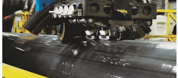
Figure 5: The tube being inspected for weld integrity with an ultra-sonic tester