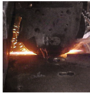
Figure 3: The tube leaving the high-frequency induction coil and passing through the weld pressure rolls

After the molten metal is extruded out of the weld area, it is cut from the outside and, if required, the inside of the tube to leave a smooth, flush surface (Figure 4). A “first off” of the weld is inspected at each setup with an in-line ultra-sonic tester (Figure 5). The amount of extrusion and the presentation and complete bonding of the strip edges are inspected to ensure weld integrity.